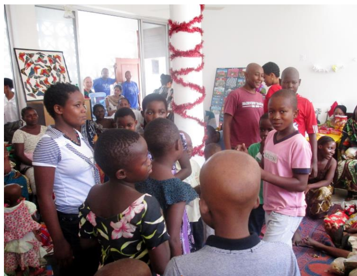
Oncology children enjoying music as part of Christmas festivities at Ujasiri House