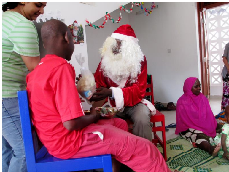
Father Christmas awarding oncology children with presents as token of Christmas celebrations at Ujasiri House