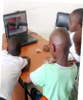
Oncology ward children during the workshop and production of animation movie.