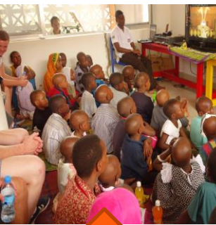
Children and parents watching Swahili animation movie produced by the children

A total number of 20 children were awarded with certificate after completion of the workshop.