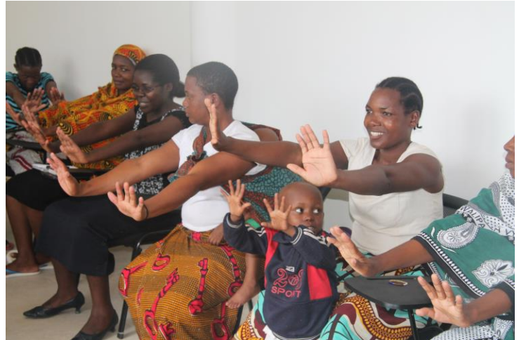
Some of the Parents learning different skills on how to overcome stress