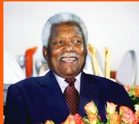
Our Patron Hon Ali Hassan Mwinyi The Former President of Tanzania