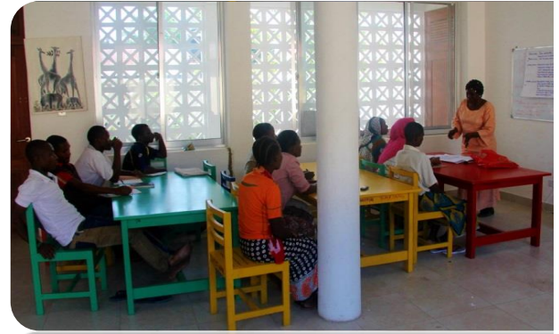
Psychologists who are TLM volunteers conducting children counseling programme at Ujasiri House