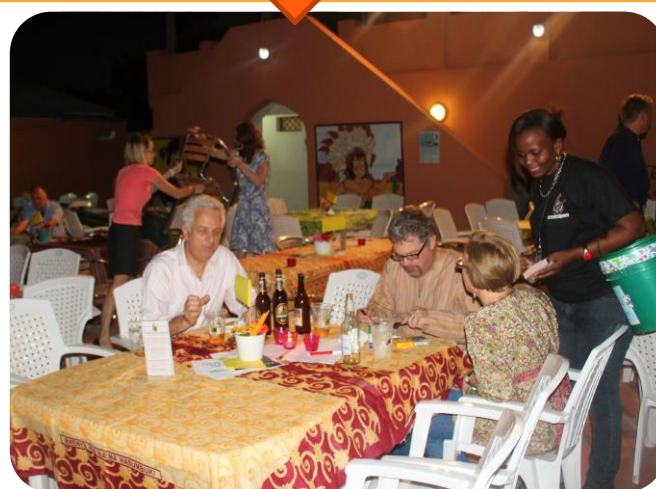
TLM Finance and administration officer selling raffle tickets during Quiz night fundraise